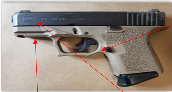
ex: Poly80 w/ Glock Slide

The Ghost Gun Emergency Amendment Act expressly prohibits the sale/transfer, registration, and possession of the Poly 80 kits such as those pictured (bottom left), that are designed, manufactured, assembled, marketed, or intended to be used as a functional frame or receiver. Any member who needs guidance please contact a member of the Gun Recovery Unit through the CIC 202.727.9099.