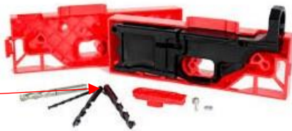
ex: Pistol Poly 80 Kit